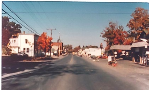
NAPLES MAIN ST.-1976