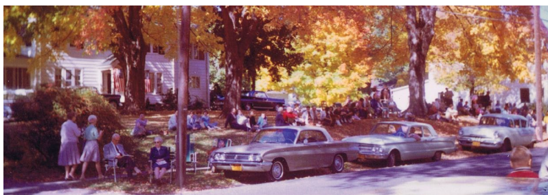
Scenes along Main St., Naples during the Naples Grape Festival, 1965: Waiting for the parade to begin ; Senator Robert F. Kennedy addresses festival crowd

After a 16-year absence, the Naples Grape and Wine Festival was revived in 1988, to herald the 100th anniversary of Widmer's