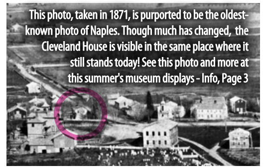
This photo, taken in 1871, is purported to be the oldest-known photo of Naples. Though much has changed, the Cleveland House is visible in the same place where it still stands today! See this photo and more at this summer's museum displays - Info, Page 3

SPRING NEWSLETTER | APRIL 2023 | P.O. Box 489, Naples, NY 14512 | NHSNYinfo@gmail.com | www.NaplesNYHistoricalSociety.org