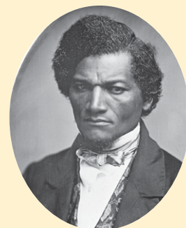
Frederick Douglass (daguerreotype by Samuel J. Miller, made ~1847-1852; in the collection of the Art Institute of Chicago)

in collaboration with the Naples Historical Society, BVT, FLX Music, Fruition Seeds, and many more!